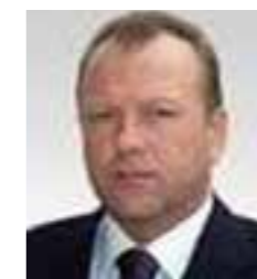
PRESIDENT Mr. Marius Vizer