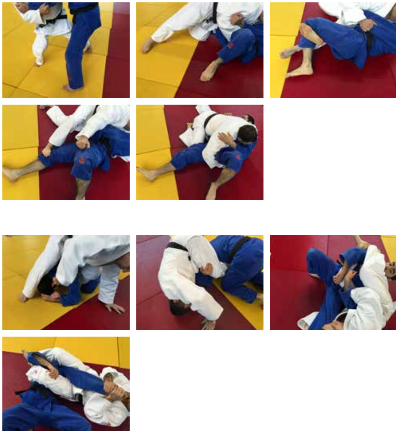
these are the two situation allowed to continue